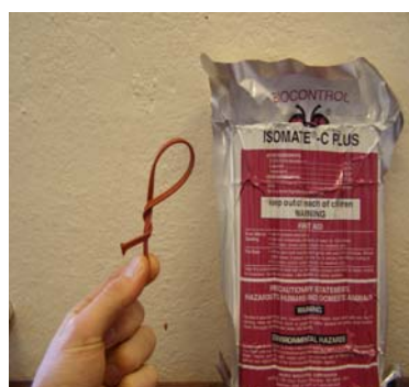
◀ Photo 6. For this trial, Isomate C-Plus pheromone emitters were hung at a density of 400/ac. The emitters are single tubes that are wrapped around or twisted into a loop and hung on branches.