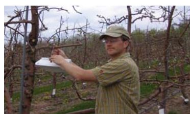
◀ Photo 8. The codling moth traps are hung in the orchard early in the season just prior to bud-break and left there all year.