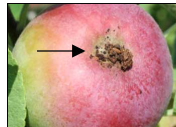
▲ Photo 3. Often the only sign an apple is infested with codling moth larvae is a small hole with frass, usually at the calyx end of the apple.